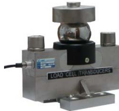
Capacity: 10T, 25T, 30T